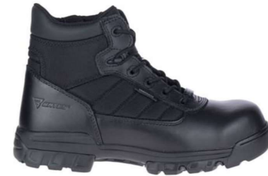
Bates 5" Tactical Sport Composite Toe Side Zip Boot $119.95