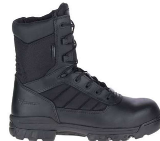
Bates 9" Tactical Sport Composite Toe Side Zip Boot $124.95

* Please remain muted and ask any questions via Zoom chat *